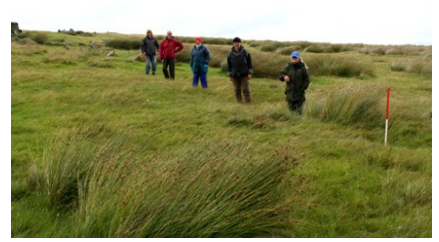
Volunteers standing in alignment of pits at south end of stone row.

Volunteers used both manual survey techniques with theodolite and plan drawing, and high tech GPS equipment to record the stone row, pits, cairns and other earthworks at the site.