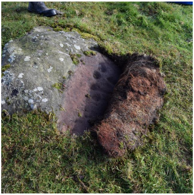
Carr Hill 9

Close to this panel is Carr Hill 9 (ERA-1470), a small boulder sloping steeply into ground below turf, decorated with 4 cups and multiple deep grooves.