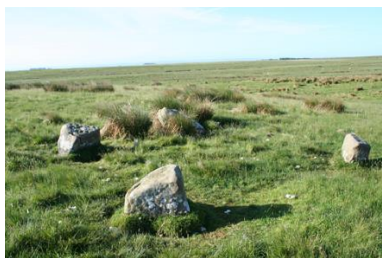
Goatstones Four Poster

The Four Poster is considered to be a burial monument and itself draws attention to the strong association between rock art and prehistoric burial practices evident across the site on the south-facing slope of Ravensheugh Crags. A detailed community archaeology Level 3 survey under the auspices of Altogether Archaeology and Northumberland National Park Authority in July 2013 recorded over 30 rock art sites. There were two extensive cairnfields in the survey area. The western clearance cairnfield revealed no rock art despite an intensive search. The eastern cairnfield which was assessed as containing at least 6 possible burial cairns contained the vast majority of rock art sites identified.