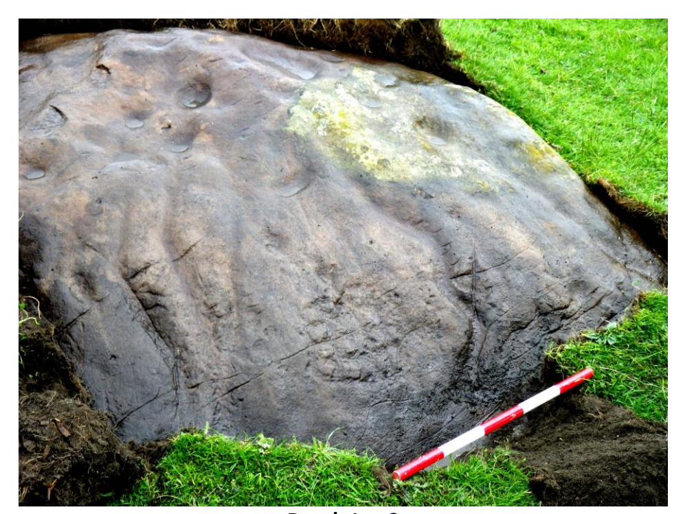
Davy's Lee 2

Davy's Lee 2 is located in the perimeter of a 14m diameter probable burial cairn. In addition to some 30 single cups it is decorated with 4 deep serpentine grooves and centrally between the grooves a grid pattern previously found at only one other Northumbrian site at Fowberry Enclosure.