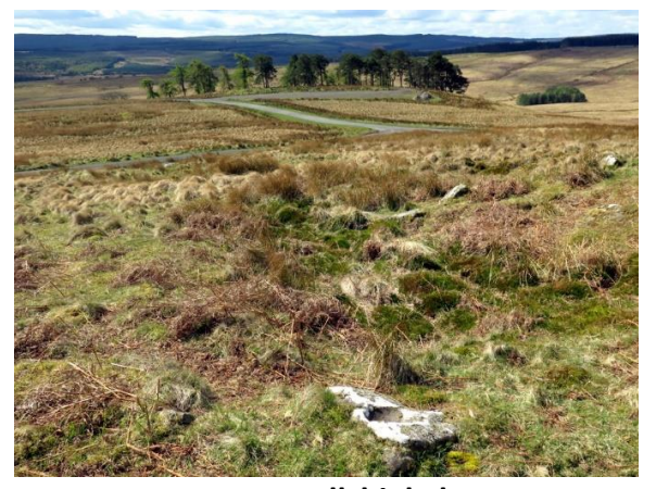
Bellshiel 1a Bellshiel 1b

Panels of group 2 are located a few hundred meters to the south of the long cairn, one of them (2d) is an earth-fast boulder in a structure of possible burial cairn. P. Deakin considered Bellshiel Law as one of the examples of the association between cup-marked boulders and cairn-fields in which the rock art panels could have been used to outline the boundaries of cairn-fields.