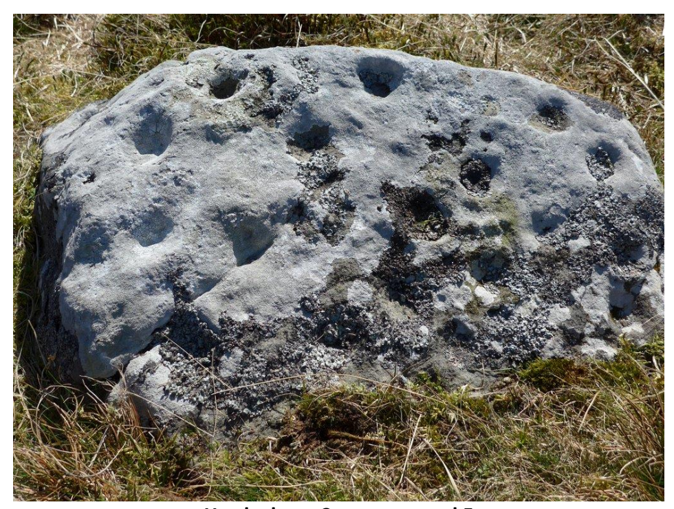
Hartleyburn Common panel 5

9 panels are listed in the ERA database although 2 of them were not recorded in prior surveys. Most have definite cup-marks. Panel 3 is a flat slab 1.4 x 0.9m carved with a very busy design of around 50 cups, some with raised arcs, and multiple grooves . Panel 5 has about 17 cups.