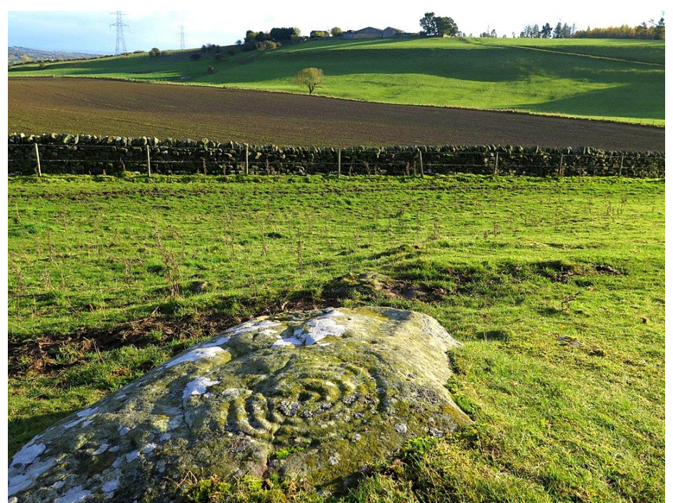
Carr Hill a

It has been pointed out that the carved rock lies just above a natural spring, formerly located in the adjoining arable field to the SE but now probably drained to the southern field edge where a well provides a water supply pumped up to Frankham Fell. It would be interesting to undertake field walking of this land after ploughing to see if flints could be found to provide evidence of prehistoric activity in this area.