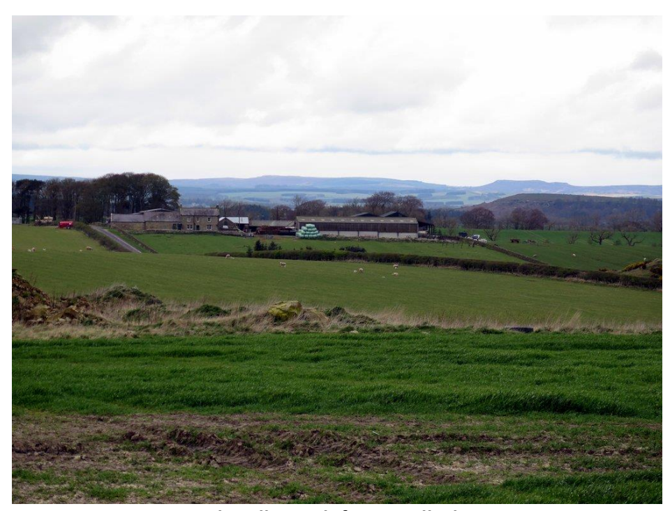
Simonside Hills north from Wallridge Moor

Our Northumberland rock art though has a power that cannot be separated from its location. It seems more desirable if panels such as this could remain where they were created, and, although on private land, still available to be seen, and yet without compromise to its long-term preservation. How this might be achieved remains one of the difficulties of such a heritage.