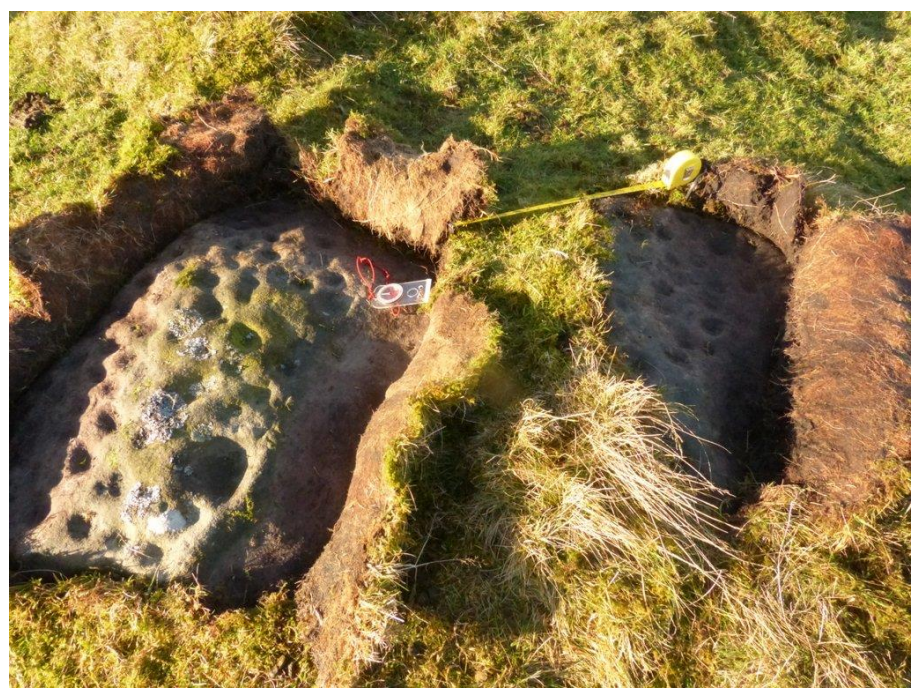
Howden Hill 1 & 2

Howden Hill 1 and 2 are located about 100m further west of the western cairn and about 50m E of a sheepfold. The two stones lie very close to each other, and are partly turf-covered. They have 50+ and 30+ cup-marks respectively.