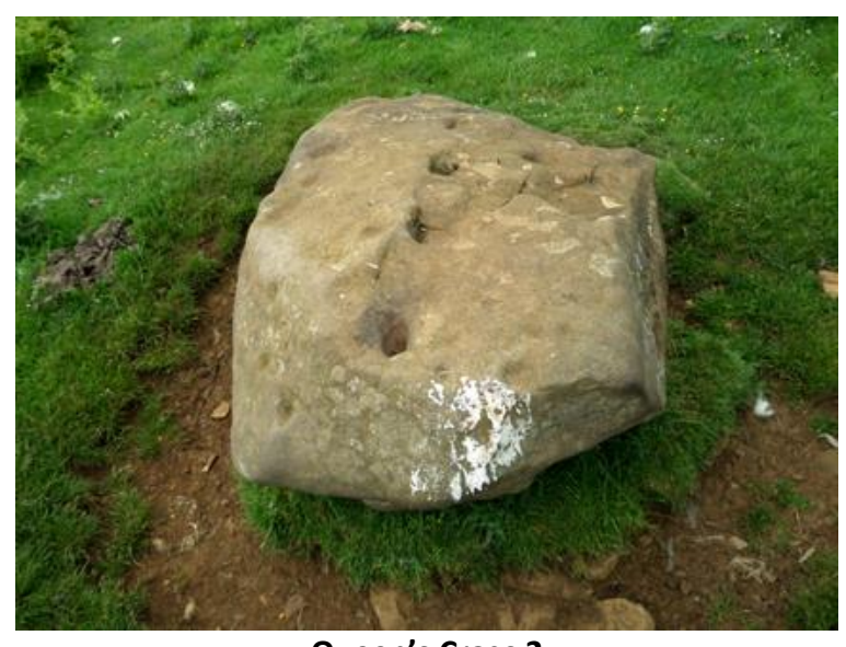
Queen's Crags 2

About 80m west of the settlement, overlooking Broomlee Lough, lies a large boulder with a series of quarrying slots running centrally and at least 15 single cups.