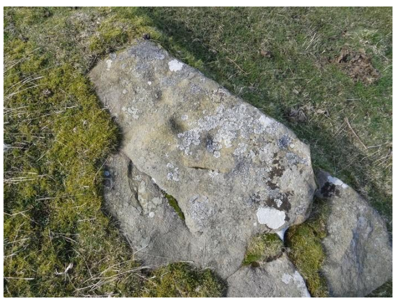
Queen's Crags 1

Following discoveries during our previous landscape surveys there are now 4 known rock art sites immediately north of Sewingshields Crags. 2 of these are located close to the Iron Age/Romano-British Enclosed Settlement on the south-facing slope of Queen's Crags. One, with an arc of 7 single cups, is located in the settlement's enclosure bank.